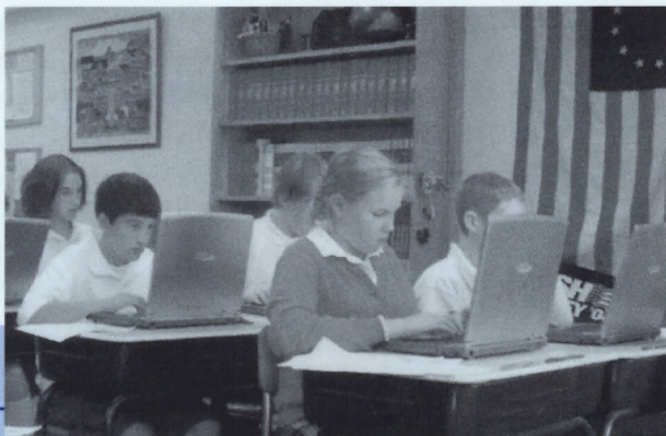
Students use the mobile computer lab to create graphs for math presentations.

Two carts, 4 feet tall and about 4 feet wide, roll down the halls at St. Hilary School nearly every day. Each cart holds 15 new computers with Windows XP software and wireless Internet capability.