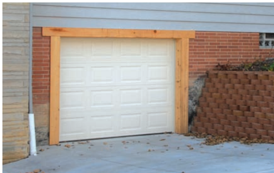
Construction of underground garage at the rectory through the generosity of Dan Marchetta, St.

St. Hilary took on projects, both large and small in 2008. We shored up the church's physical structure by repairing the roof and replacing the kneelers.