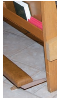
New kneelers in the church and new red song books

We achieved a great deal in 2008, but there is much left to be done. Please continue to support the Foundation. We are grateful for gifts large and small and we recognize that your generosity has a lasting impact.