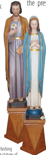
Refurbishing of the statues of Joseph and Mary, a donation from an anonymous donor

St. Hilary School kept up its tradition of excellence with a renewal of the prestigious Blue Ribbon School designation.