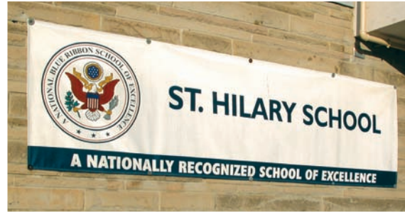
2008 Scholarships through the Carlson Scholarship Fund and the Scholarship/Tuition Assistance Fund, and additional funding for teacher salaries through the Teacher Salary Fund

St. Hilary School kept up its tradition of excellence with a renewal of the prestigious Blue Ribbon School designation.