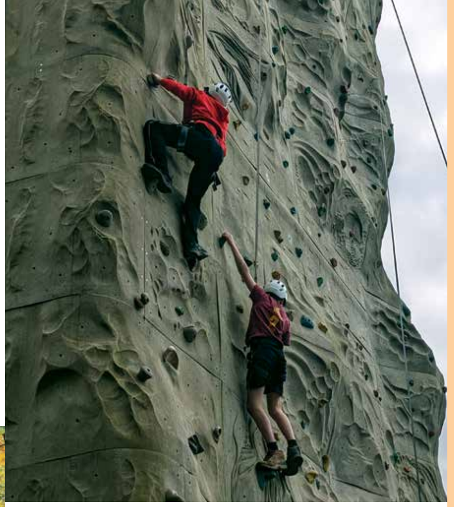
Adventure on the rock climbing wall is a favorite activity among many students attending the Damascus Catholic Mission Campus retreats.

St. Hilary School seventh grade students participated in the Leadership Retreat at Damascus October 12-14. Seventh grade students are at a critical point in their lives as they move into young adulthood. The Damascus ministry team seeks to capitalize on this time by helping seventh graders to develop important leadership skills that will serve them well not only now, but as they move toward high school and beyond. The call to leadership is first a call to discipleship. At the retreat, a series of cooperative initiatives challenge students to grow in virtue, problem-solving, and communication, while looking to Jesus as model and teacher. The retreat center's trained staff guides students through courses that have been developed in partnership with