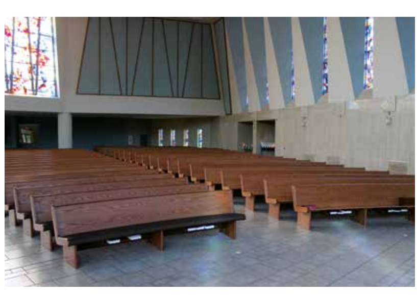
Above: Through the generous legacy of Jean Hauser, pews and floor tile were replaced in the church during the summer. Right: Stained glass windows removed from the rectory have a new, more prominent home as they grace the entrance to the reposition chapel.

from the rectory and installed in the sacristy and reposition chapel, totaling $4,765. New security features, including cameras, a monitor, and keypad locks on doors were installed at the Spiritual Center and parish offices, at a cost of $20,091. The PSR office also received a small update for $2,486. Evangelization efforts were supported at a cost of $13,697, and the Gaudete and Laetare Sunday Concerts were funded for $4,988.