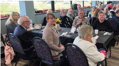
Photo: Volunteers are recognized at our annual Thanksgiving luncheon.

Our volunteers help out in the office, in the kitchen, teach classes, lend a hand at events and so much more. Volunteers pitched in to help our agency fulfill its mission in 2025, including those who comprise the Compassion in Action non-medical volunteer caregiving program, providing transportation to shopping and appointments, light yard work, light housekeeping and friendly visits. We continued our partnership with Integrated Community Solutions to participate as shoppers in our Shop for a Senior program, providing involvement in the community for disabled adults.