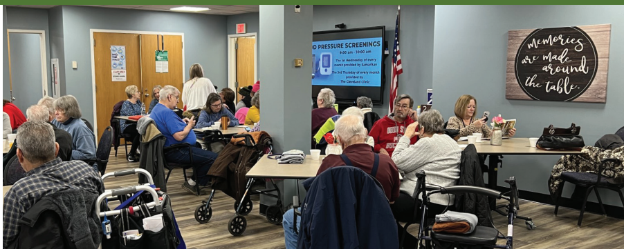
2023 Meals By Month