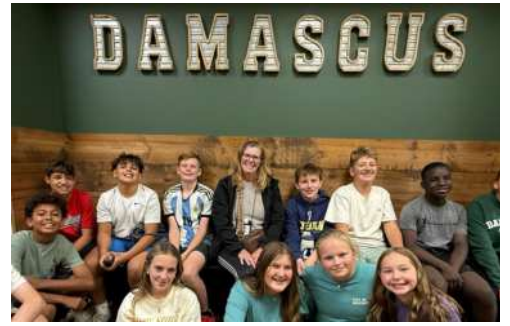
St. Hilary School seventh graders on retreat at the Damascus Catholic Mission Campus.

the Decision Point Confirmation Retreat, during which Confirmandi explore the meaning of the Sacrament and the choice to embrace the fullness of life in Christ. All retreats culminate with an opportunity for Eucharistic Adoration. Smaller scale retreats are held during the school day several times a year for the school's fifth grade students, to help them build relationships with Christ and with peers. During Lent, seventh and eighth grade students are invited to the school's Breakfast of Champions events, which begin with 7:00 am Mass and conclude with a faith-based speaker, featuring a home-cooked breakfast.