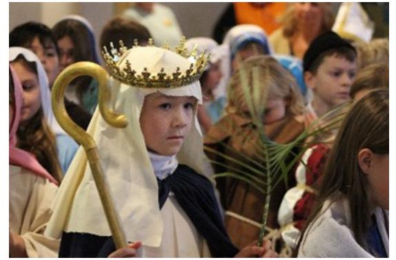
St. Hilary School third graders dress as saints for All Saints Day.