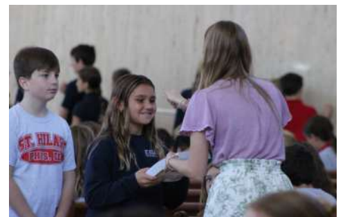
A student receives a blessing and a gifted Bible during St. Hilary School's Bible Enthronement service.