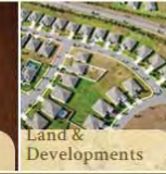
Land &amp; Developments