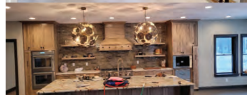
Outstanding Lighting, Furniture & Home Decor