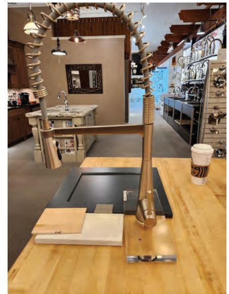
Wolff Bros. Medina Design Showroom - perfect for your homebuyers to select many of their new home products.

In addition to the extensive array of high quality and diverse products available, this amazing company provides support to builders, designers and homeowners through their four Wolff Design Centers located in Toledo, Sandusky, Medina and Akron. These Design Centers focus on providing personalized professional guidance on residential kitchen, bath and lighting projects, not to mention saving both the contractor and the customer a lot of time not having to run around to different show rooms with an armful of samples, and