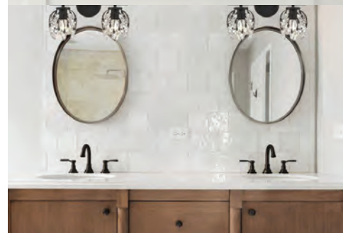
On-Site Consultation | Lighting Design Contractor & Designer Discounts Personalized Shopping Experience