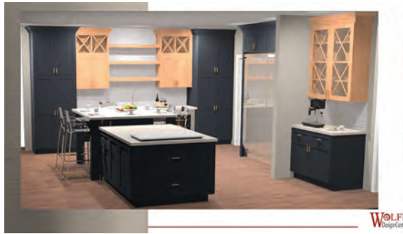
Wolff Bros. 20/20 program allows renderings like the picture above (and the one below) to be produced to help customers determine colors, design, layout and more.

Many smaller custom builders simply do not have the additional specialty staff to assist their customers with selections or need assistance with streamlining their own time at the construction site. As an extension of the builder, Wolff Bros. Supply is proud to partner with builders