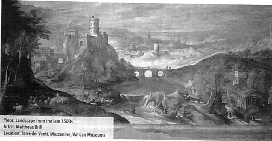
Piece: Landscape from the late 1500s Artist: Mattheus Brill Location: Torre dei Venti, Mezzanine, Vatican Museums

How does our Lord want to see fruit and growth in your life? Have I squandered God's harvest in my life?