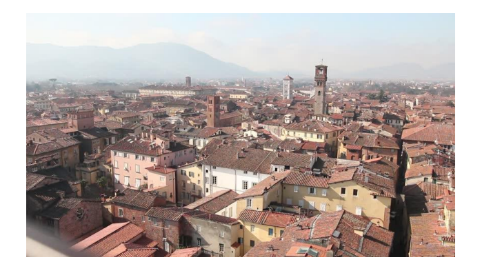
<u>Day 6</u> - Morning breakfast included . After breakfast we will depart by fast train , to visit the vibrant city of Florence . You will marvel at the sites of David of Michelangelo at l'Accademia, included . Enjoy a local restaurant for typical Florentine cuisine, included . Florence, the capital of Italy's Tuscany region, is home to many masterpieces of Renaissance art and architecture. One of its most iconic sights is the Duomo, a cathedral with a terracottatiled dome engineered by Brunelleschi and a bell tower by Giotto. The Galleria dell'Accademia displays Michelangelo's "David" sculpture. The Uffizi Gallery exhibits Botticelli's "The Birth of Venus" and da Vinci's "Annunciation." We will return back to our hotel in Montecatini Terme for dinner on your own.