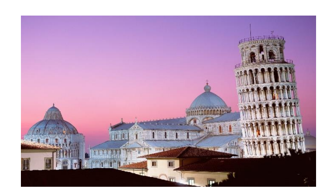
<u>Day 5</u> - Breakfast at the hotel, included . Depart in our luxury coach bus for a guided tour to visit the leaning tower of Pisa . We will continue to a local winery for lunch and wine tasting, included . Time permitting, we will visit the city of Lucca then to our hotel in Montecatini for free time and dinner on your own.