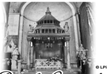
World Day for Consecrated Life

the Collection for the Church in Latin America that is managed by the U.S. Conference of Catholic Bishops and benefits projects and the formation of seminarians, religious and lay leaders in 23 countries across Latin America.