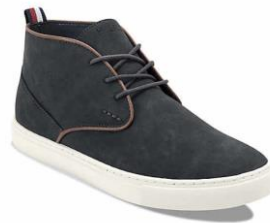
Not permitted (white sole)

Photos are examples and not intended to represent every potential boot style.